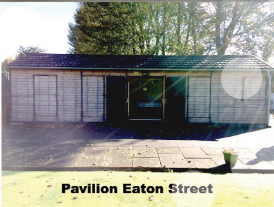
Pavilion Eaton Street