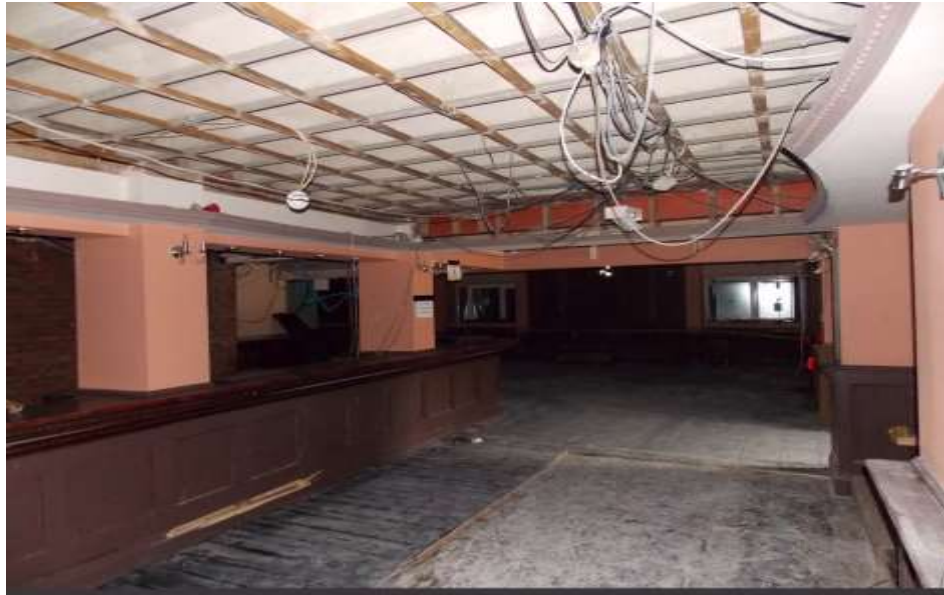
Internal Ground Floor Before